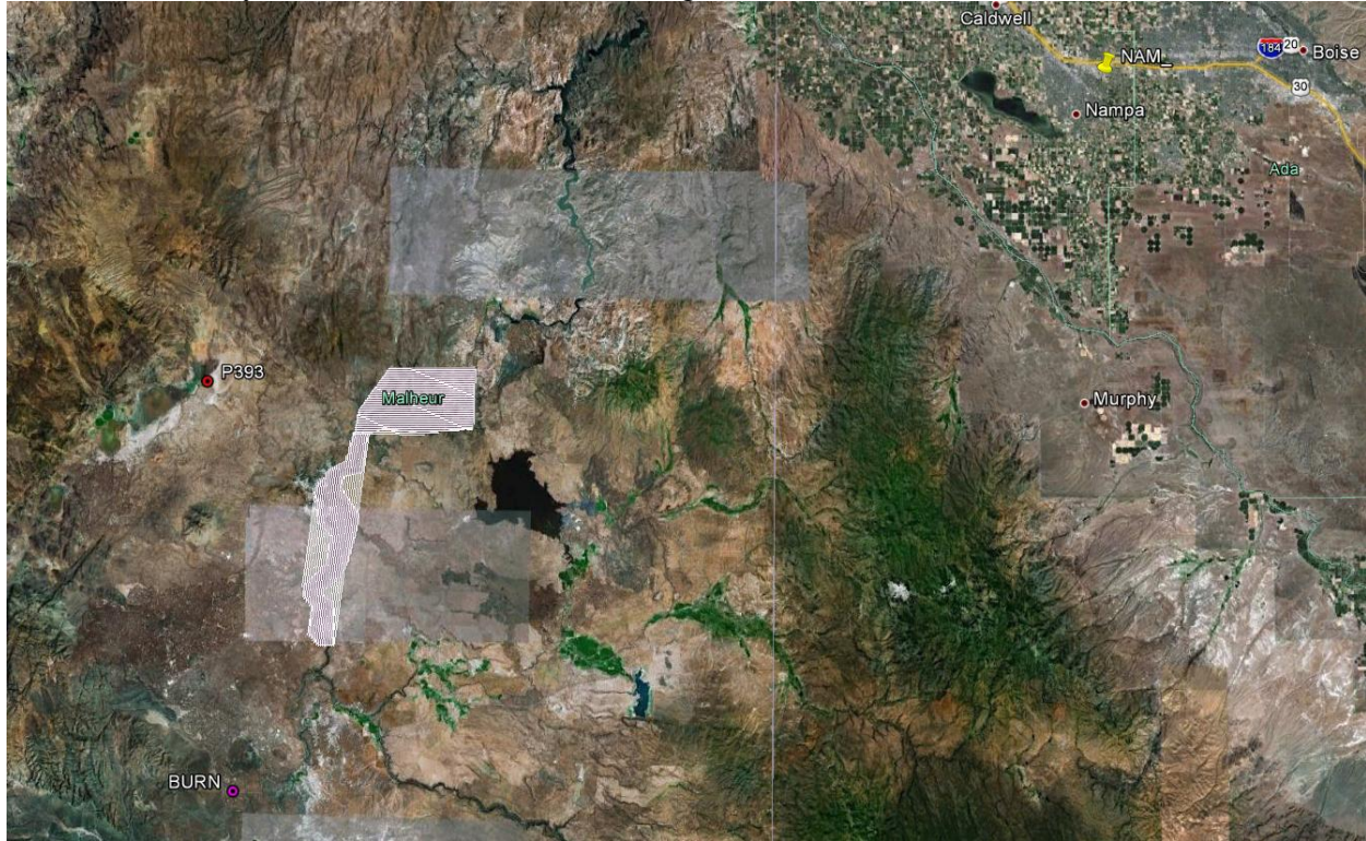
Figure 1 – Shape and location of survey polygon.

The survey area consisted of a polygon located in eastern Oregon, 120 km southwest of Boise, Idaho. The survey location is shown below in Figure 1.